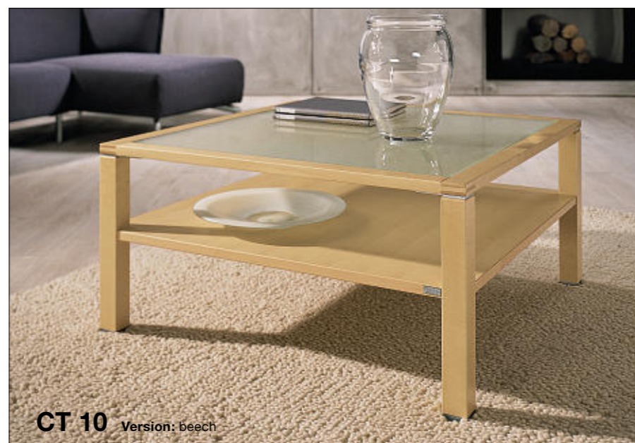
CT 10 Version: beech

Square or rectangular: the 45.0 cm high CT 10 is available in 70 x 70, 90 x 90 and 120 x 70 cm. The upper table top is available in wood, sand or white rear-lacquered glass, in clear glass, satinized or stained glass. The lower table top is always made from wood.