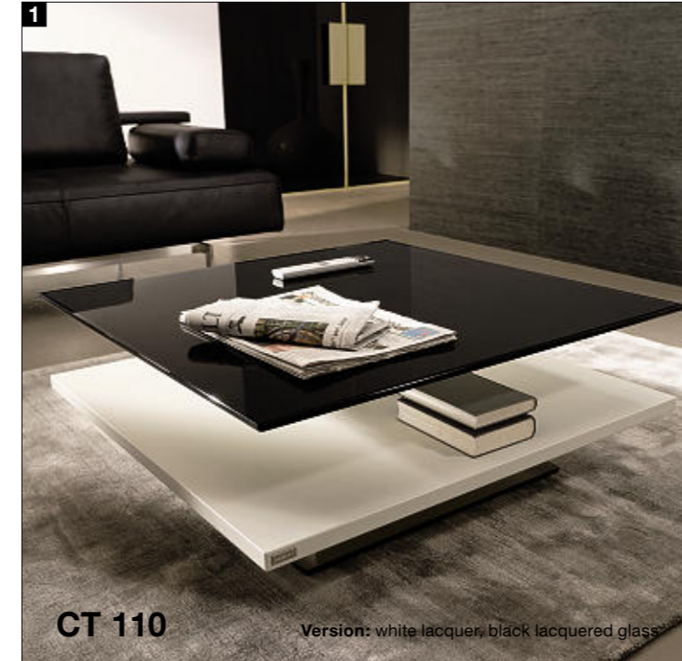
CT 110 Version: white lacquer, black lacquered glass