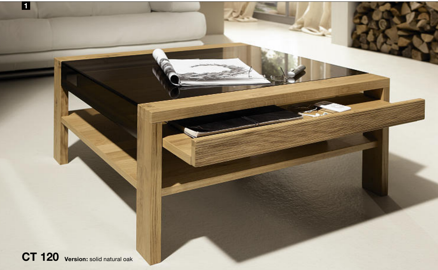
CT 120 Version: solid natural oak

3 A completely different look using almost the same components. The white lacquered table top beautifully highlights the central wooden feature. The two 70 x 70 cm table tops offer plenty of space.