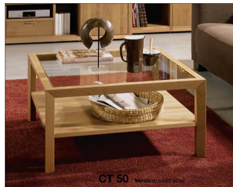
CT 50 Version: solid alder

Square or rectangular: the 45.0 cm high CT 10 is available in 70 x 70, 90 x 90 and 120 x 70 cm. The upper table top is available in wood, sand or white rear-lacquered glass, in clear glass, satinized or stained glass. The lower table top is always made from wood.