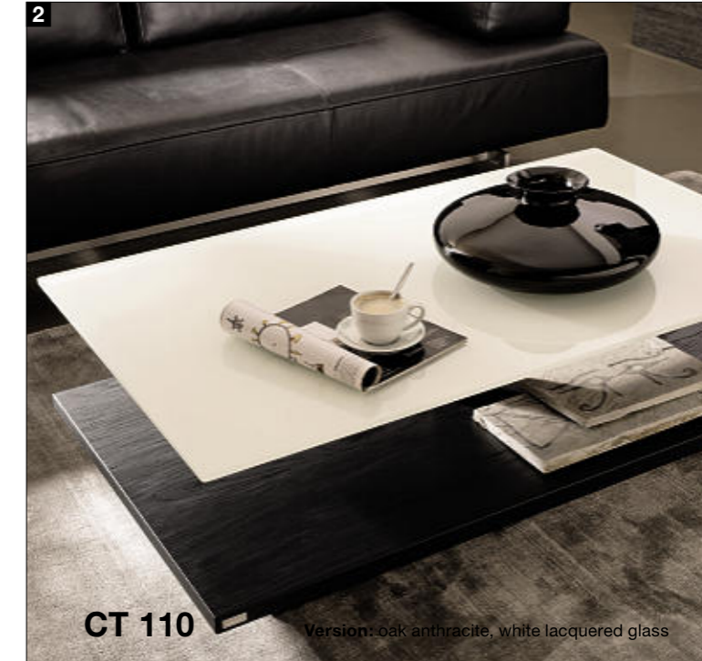
CT 110 Version: oak anthracite, white lacquered glass