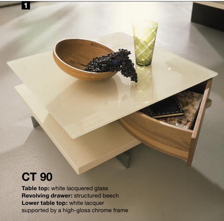
CT 90 Table top: white lacquered glass Revolving drawer: structured beech Lower table top: white lacquer supported by a high-gloss chrome frame

to float, defying gravity, whilst the beautifully clean and simple lines of the coffee tables are irresistibly attractive.