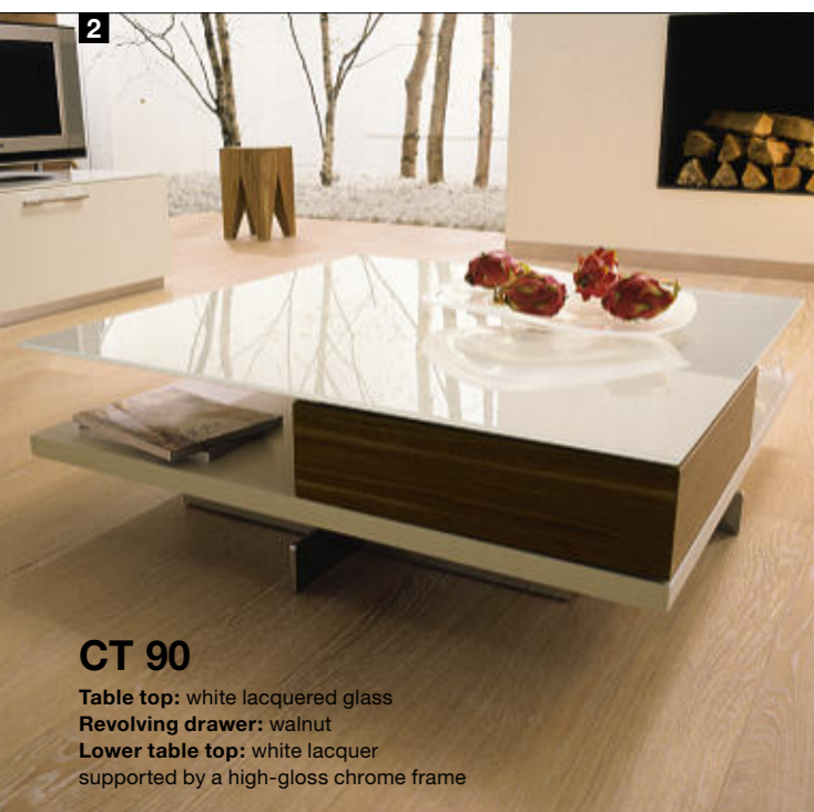
CT 90 Table top: white lacquered glass Revolving drawer: walnut Lower table top: white lacquer supported by a high-gloss chrome frame