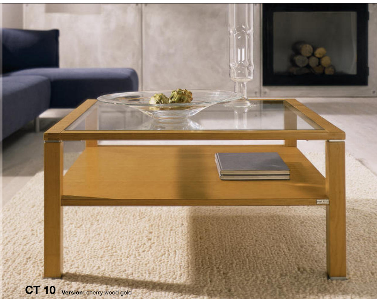
CT 10 Version: cherry wood gold