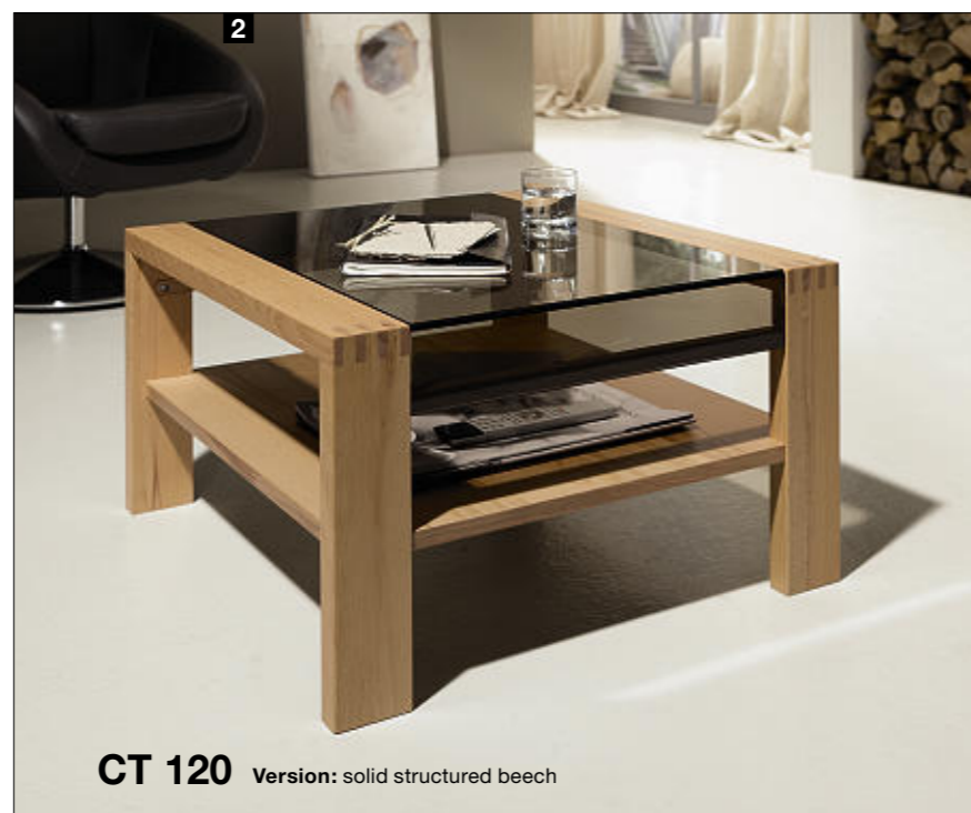
CT 120 Version: solid structured beech

2 Less is more! The CT 120 with its clean and simple lines and the solid wood frame provides a stunning visual impact even without the drawer. Available in 70 x 70 cm or – as a slightly larger version – in 90 x 90 cm square.