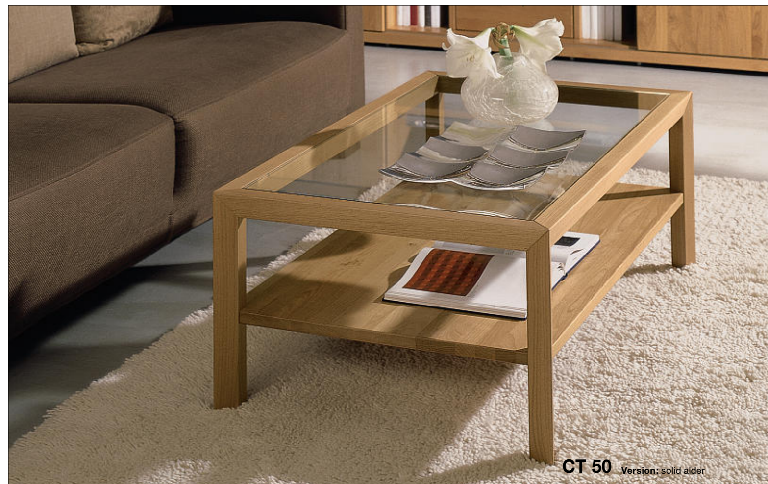
CT 50 Version: solid alder