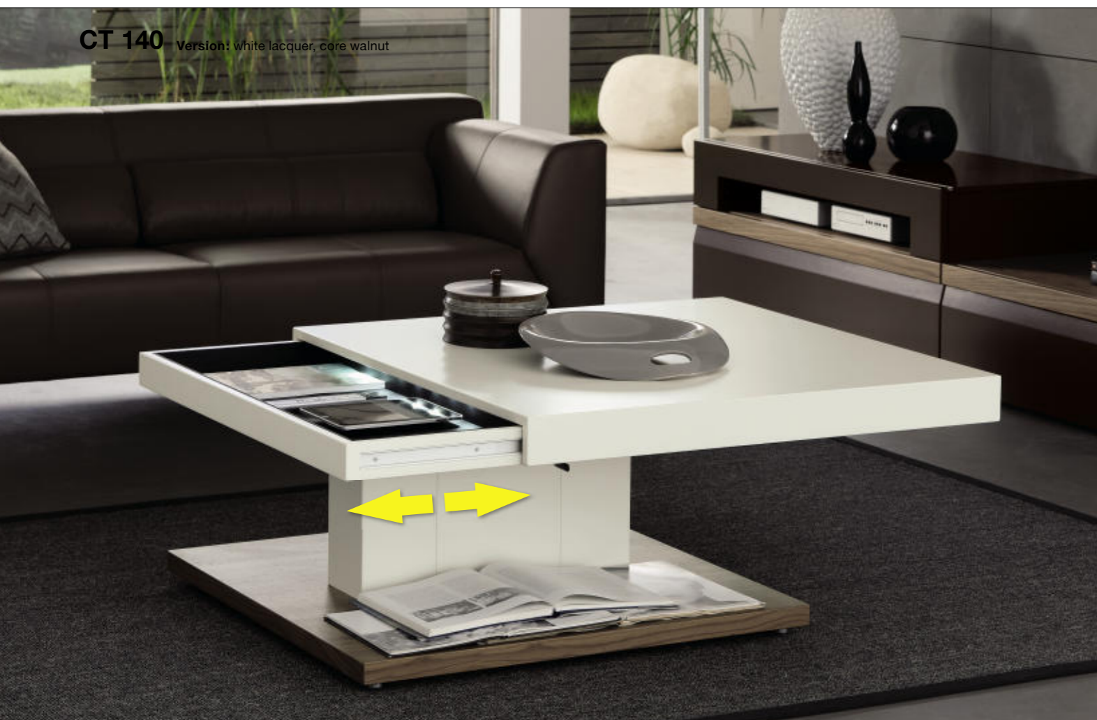
CT 140 Version: white lacquer, core walnut

the top one in white lacquer or brown-black lacquer. The tabletop can be adjusted to any height and even be pushed aside. Underneath, there is a practical compartment, which can even be fitted with interior lighting if required.